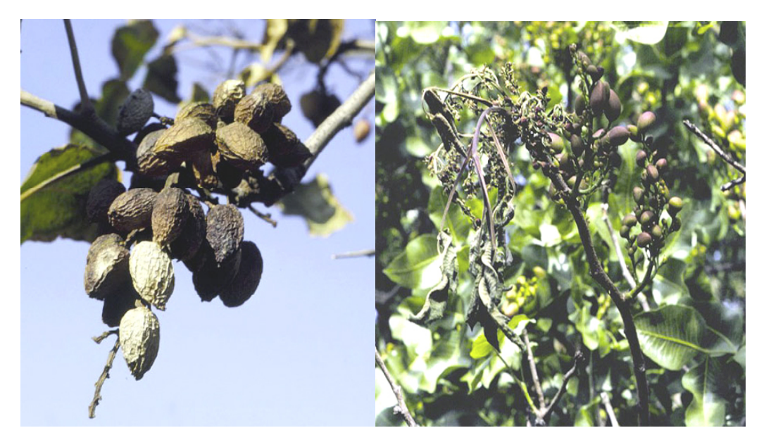
Figure 2: Wilting of pistachio branch and fruits because of root rot of tree by soil borne fungi in gardens.

and amendments were analyzed as a control measure against soil born fungi and nematodes and resulted in about 12°C increase in the soil temperature in other places (15). This increase in soil temperature caused a reduction of about 70 to 80% in the fungal population and about 99% in nematode population at various depths.