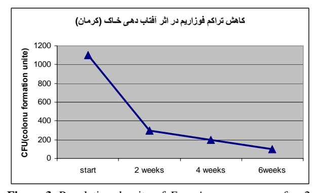
Figure 3 : Population density of Fusarium oxysporum after 2, 4 and 6 weeks soil solarization method in Kerman province nearly south, Iran

Pre-harvest aflatoxin contamination can also be reduced by applying Integrated Phytosanitary management which seeks to minimize the mould spore count in the orchard and minimize the chances of insect attack (3). Removal or burial of tree litter has been suggested as a measure that would significantly reduce spore count. Postharvest aflatoxin contamination can occur as a result of harvesting by shaking the tree. This can cause tearing of the hull which can let in spores and allow aflatoxin to be produced. Nuts which are allowed to fall to the ground naturally may also become moldy if they are left on the ground for an extended period. Pistachios are then either harvested by hand or natural fallers are collected daily. Immunosuppressive agents, produced as secondary metabolites by the fungus Aspergillus flavus and A. parasiticus on variety of food products (16).