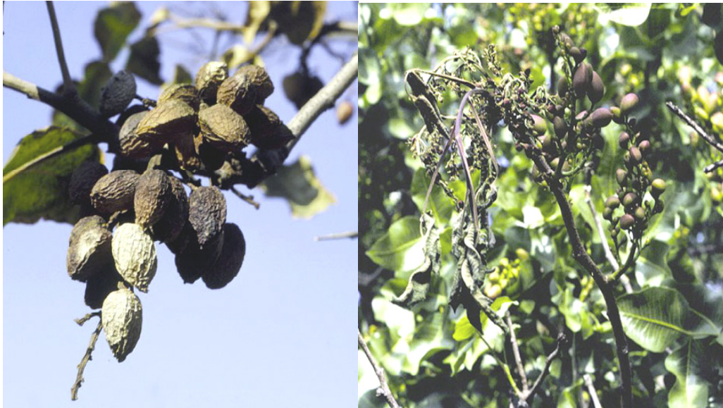
Figure 2: Wilting of pistachio branch and fruits because of root rot of tree by soil borne fungi in gardens.

Soil solarization and amendments were analyzed as a control measure against soil born fungi and nematodes and resulted in about 12°C increase in the soil temperature in other places (15). This increase in soil temperature caused a reduction of about 70 to 80% in the fungal population and about 99% in nematode population at various depths.