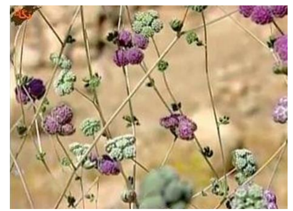
Fig. 2- O. decumbens plant

There are two main challenges when adding essential oils in bread. Firstly, they might change bread's taste and secondly, the high temperature during baking can alter the composition of the essential oils. Using natural antimicrobial compounds in bread and baking products packaging can reduce the problems mentioned above to some extent. However, high temperature is also used in the production of packaging film; therefore, in addition to investigating the antimicrobial properties of essential oils against the main bread spoilage microorganisms, their thermal resistance should also be carefully studied.